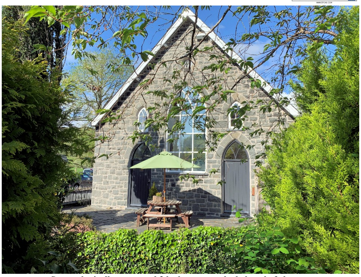
Sympathetically renovated 3 bedroom attached chapel of character Stunningly presented Large open plan living area Cloak room Utility Paved terrace with rural views Bespoke insulated shed