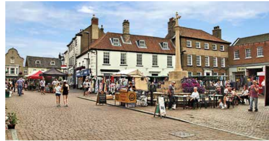
Fakenham weekly market

“The property is perfectly positioned just a short walk from the town and all its amenities”