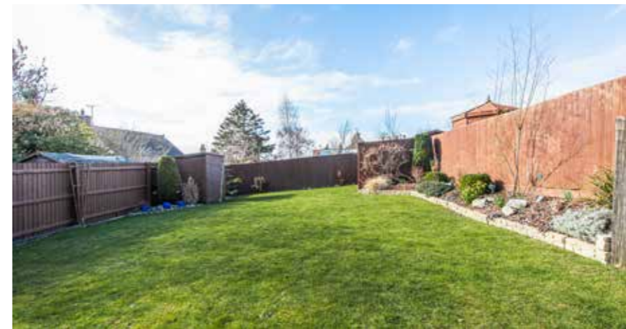
The garden at 9 Mill View

“After a busy day at work, the conservatory is the perfect place to relax and watch the birds in the garden.”