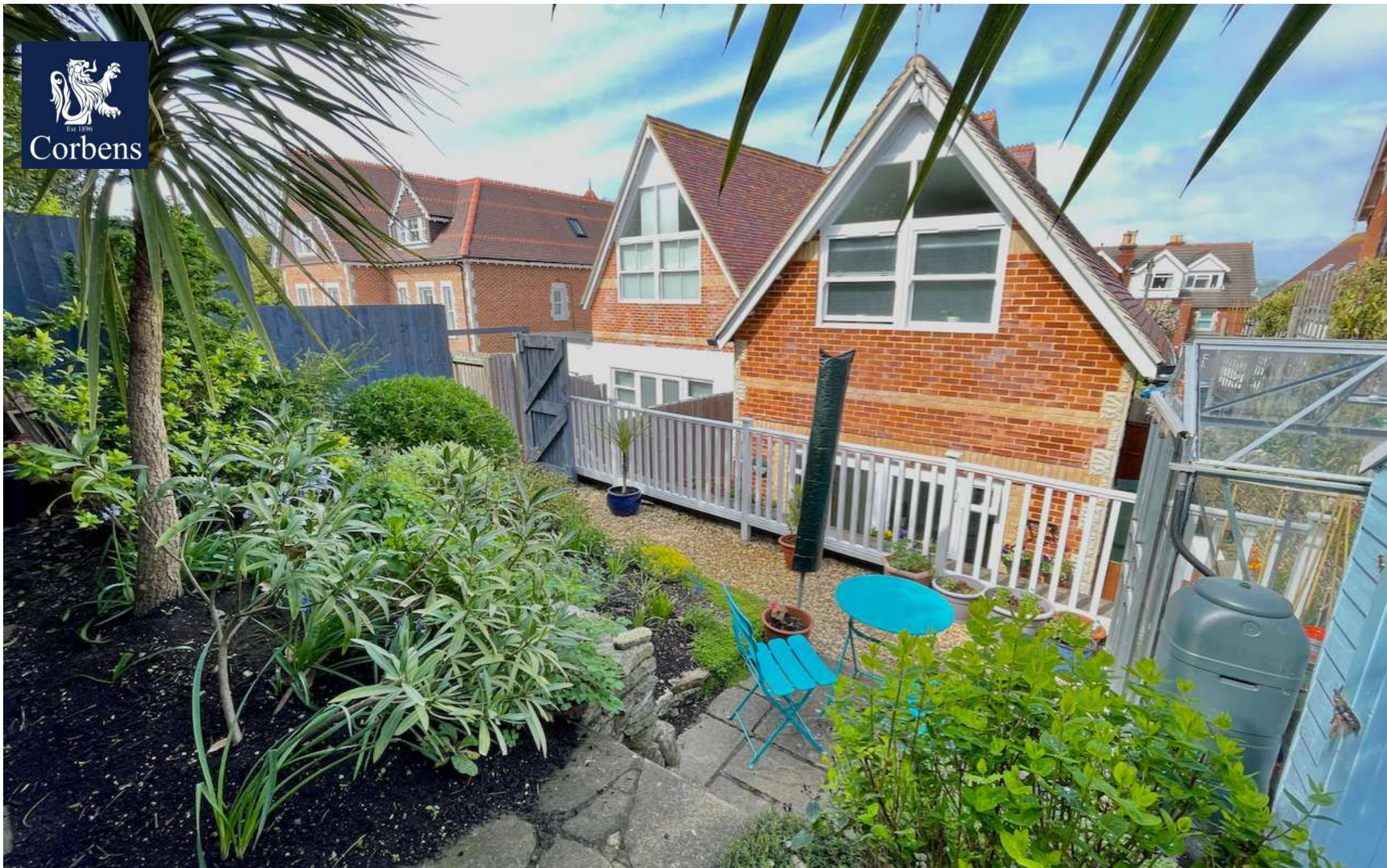
CORBEAU LODGE, 24 CLUNY CRESCENT, SWANAGE £365,000