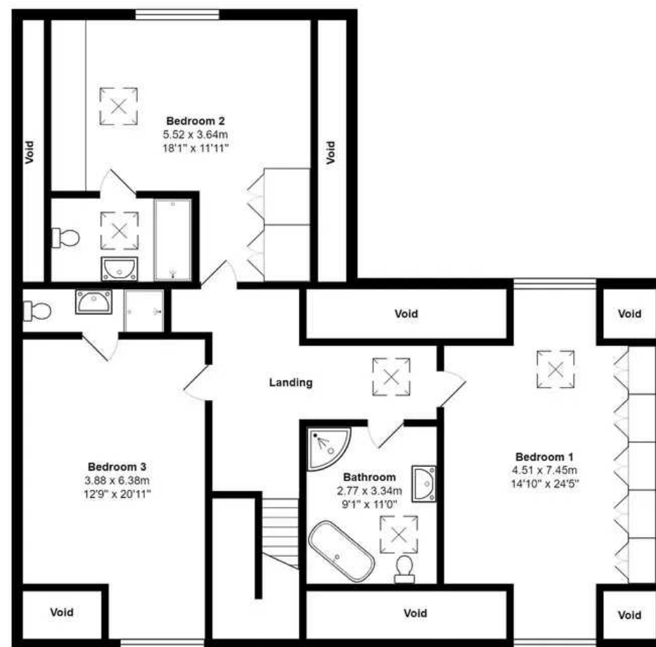
First Floor Area: 117.7 m 2 ... 1267 ft 2