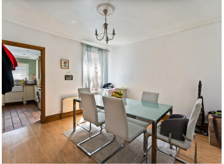
98 Tharp Road, Wallington, Surrey, SM6 8LE | £475,000 Freehold

Paul Graham are delighted to offer this attractive Victorian terrace house which is situated within easy reach of a number of reputable schools and Mellows Park. The accommodation which is laid out over three floors boasts two reception rooms and a good size kitchen. There are three double bedrooms and a spacious bathroom. Outside there is a southerly aspect rear garden. Wallington town centre offering a range of shops and amenities and station providing routes to London are within walking distance.