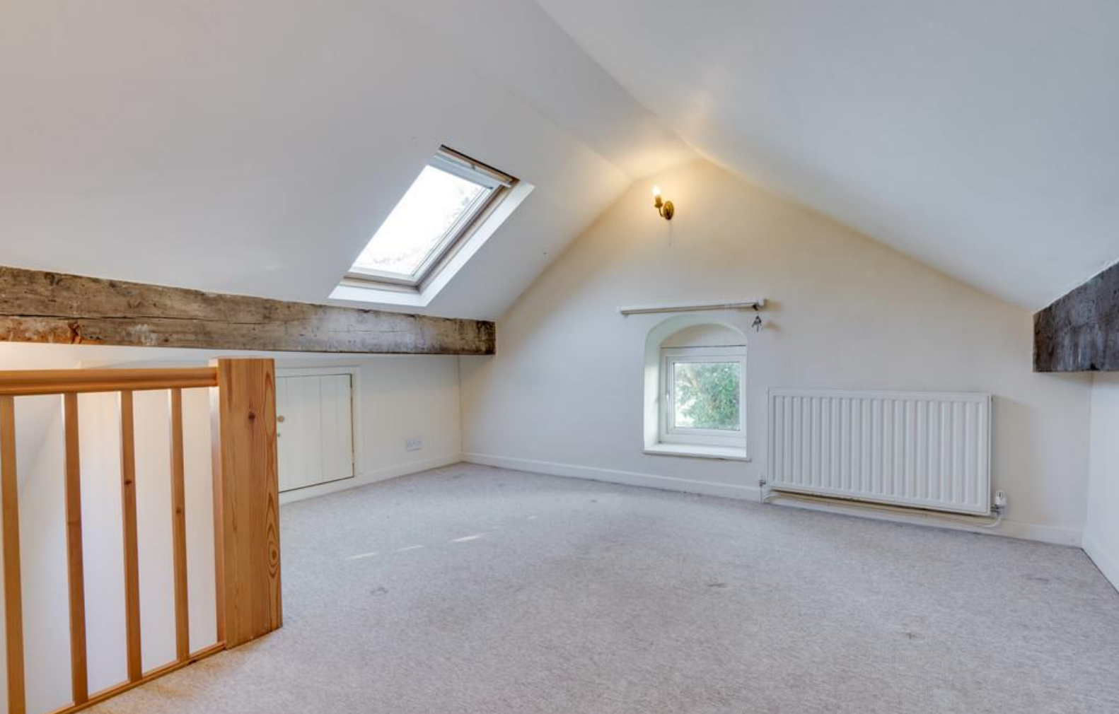
Attic Bedroom 3