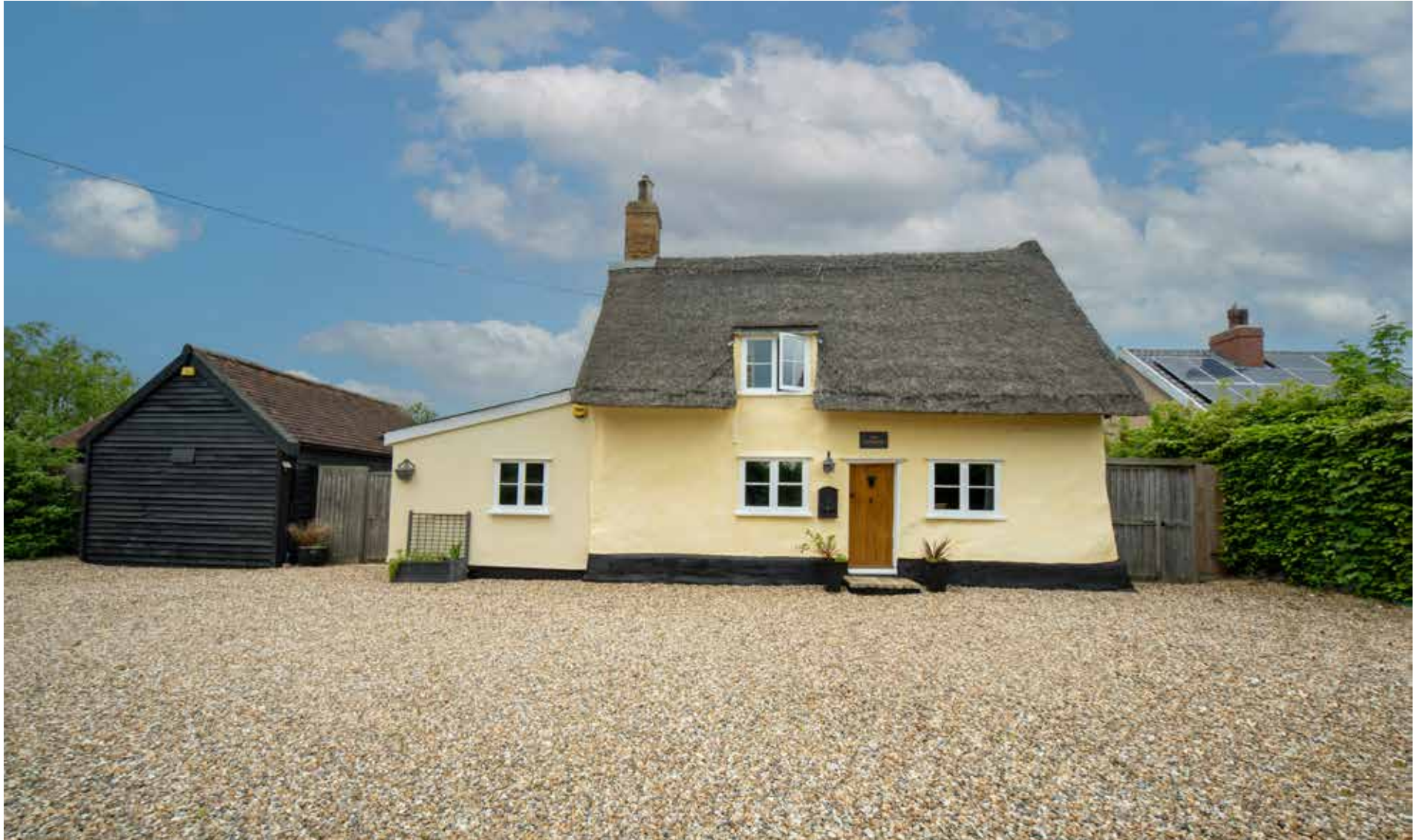
'Chocolate Box Cottage' Wortham, Norfolk | IP22 1RG