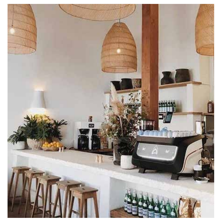
*Subject to confirmed tena

Surrounded from all angles by opportunities for openair adventure, One Pentire is stylishly secluded but still sits comfortably in the vicinity of all much-needed amenities. Adjacent to the wilderness of the Gannel estuary, harking back to Newquay's seafaring past, in reach of dramatic sea cliffs neighbouring rolling sand dunes, and a stone's throw from rugged headlands carpeted with colourful flora and fauna and the enigmatic pull of the mighty Atlantic Ocean.