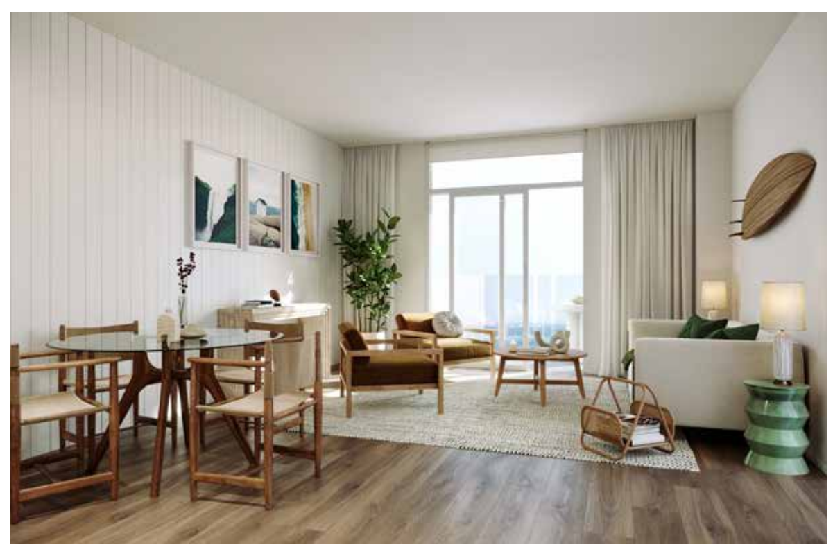
CGI of the living room as found in 2 bedroom apartments 10, 21 and 32.

The aspirational location of Pentire is fast-becoming one of Cornwall's most lucrative property hotspots. A special collection of 74 spacious apartments just a stone's throw from iconic surf-beach Fistral. The boutique development hosts nine outstanding penthouses, and 65 exclusive studio, one, two and three bed apartments, expansive underground parking for all apartments with lift access to each floor. Adding to the lifestyle benefits is space for a wine bar and café-deli on the ground floor, and idyllically landscaped gardens.