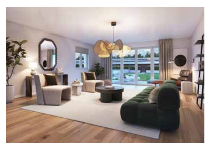
Left - The Nest, Charlestown - Living Room

30 years of experience has seen Absolute become on of the South West's most effective, creative and in-demand agencies. Constantly setting new standards and winning awards across it's diverse portfolio of one-off private clients and national hospitality and retail businesses, Absolute is a collaborative partner with Stephens + Stephens on One Pentire's architectural and interior design.