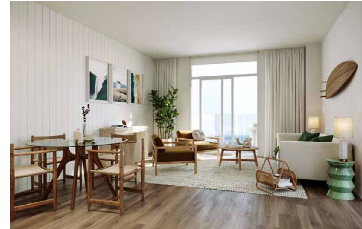
CGI of the living room as found in 2 bedroom apartments 10, 21 and 32.

The aspirational location of Pentire is fast-becoming one of Cornwall's most lucrative property hotspots. A special collection of 74 spacious apartments just a stone's throw from iconic surf-beach Fistral. The boutique development hosts nine outstanding penthouses, and 65 exclusive studio, one, two and three bed apartments, expansive underground parking for all apartments with lift access to each floor. Adding to the lifestyle benefits is space for a wine bar and café-deli on the ground floor, and idyllically landscaped gardens.