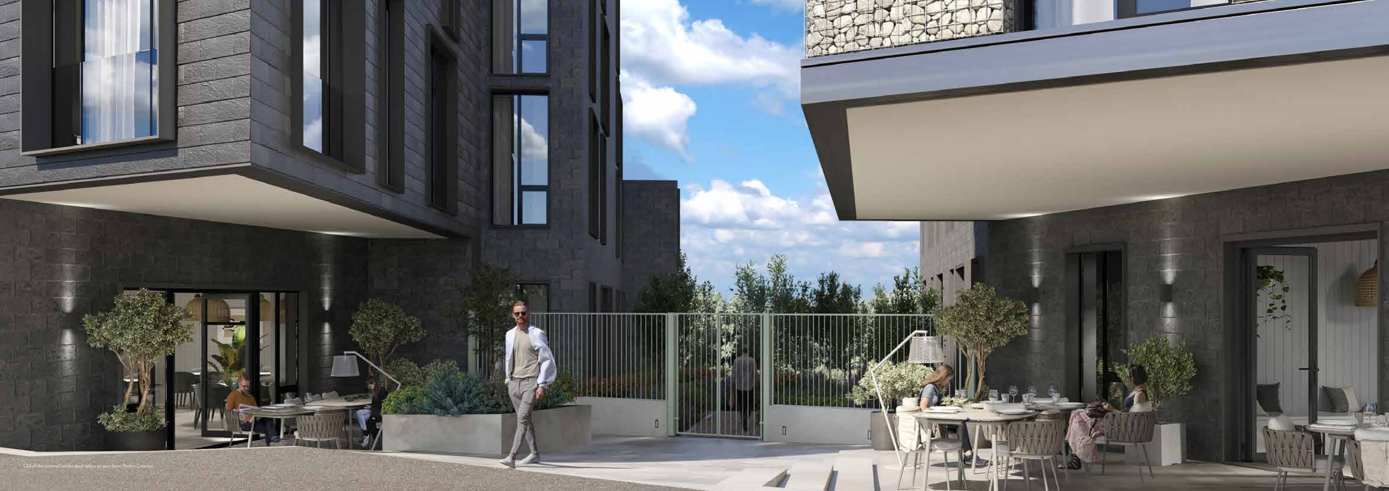
CGI of the external landscaped space as seen from Pentire Crescent.