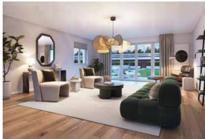
Left - The Nest, Charlestown - Living Room Right - Cliff Edge, Tolcarne Beach - Penthouse

30 years of experience has seen Absolute become one of the South West's most effective, creative and in-demand agencies. Constantly setting new standards and winning awards across its diverse portfolio of one-off private clients and national hospitality and retail businesses, Absolute is a collaborative partner with Stephens + Stephens on One Pentire's architectural and interior design.