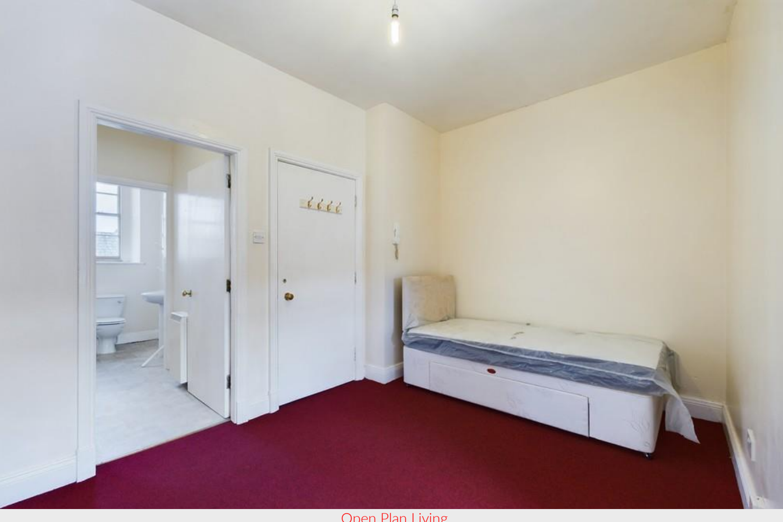
Open Plan Living

Location: From the Penrith Office, take a right hand turn, then a left hand turn at the Skipton Building Society. Follow Little Dockray and the property can be found straight ahead above Couture Hairdressers.