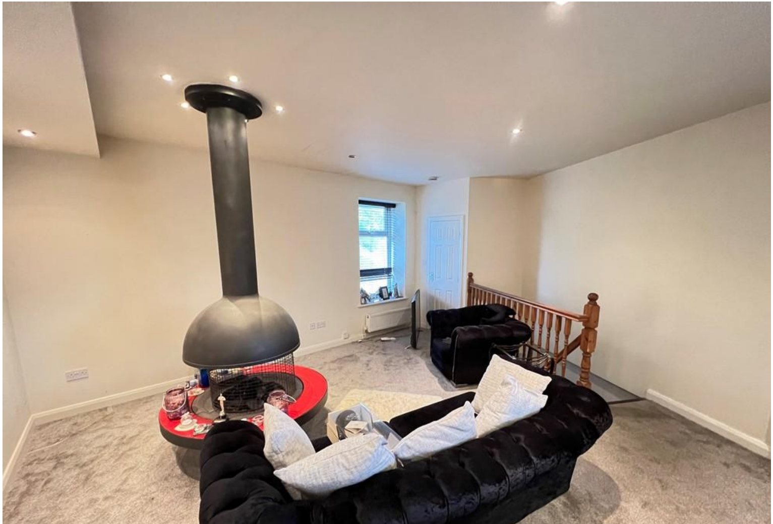
Sandy Lane, Lower Darwen, Darwen

2 Preston New Road, Blackburn, Lancashire, BB2 1AW Tel. 01254 582489 Email. blackburn@proctorsestateagents.co.uk Web. proctorsestateagents.co.uk