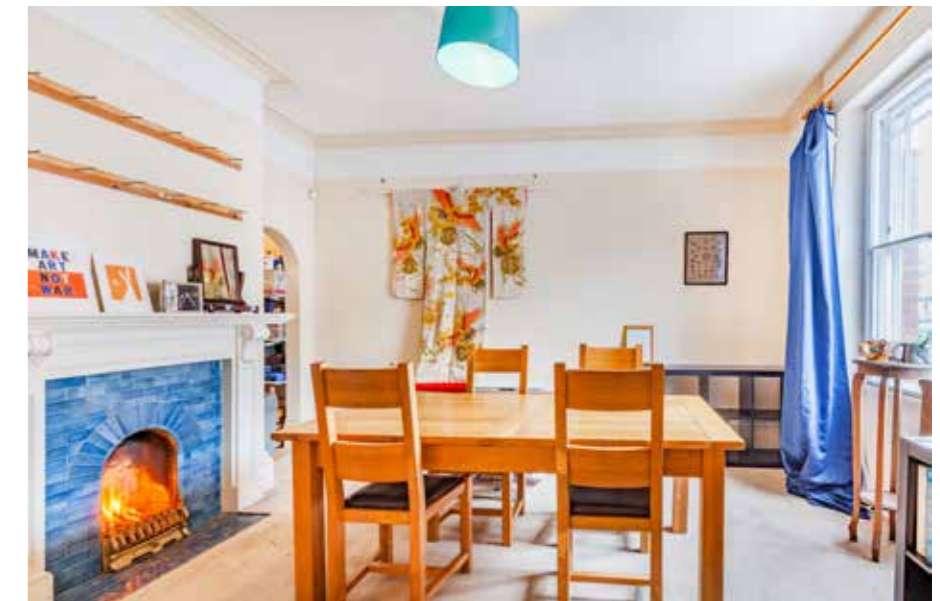
A Charming Space