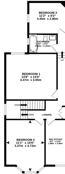
1ST FLOOR 764 sq.ft. (70.9 sq.m.) approx.