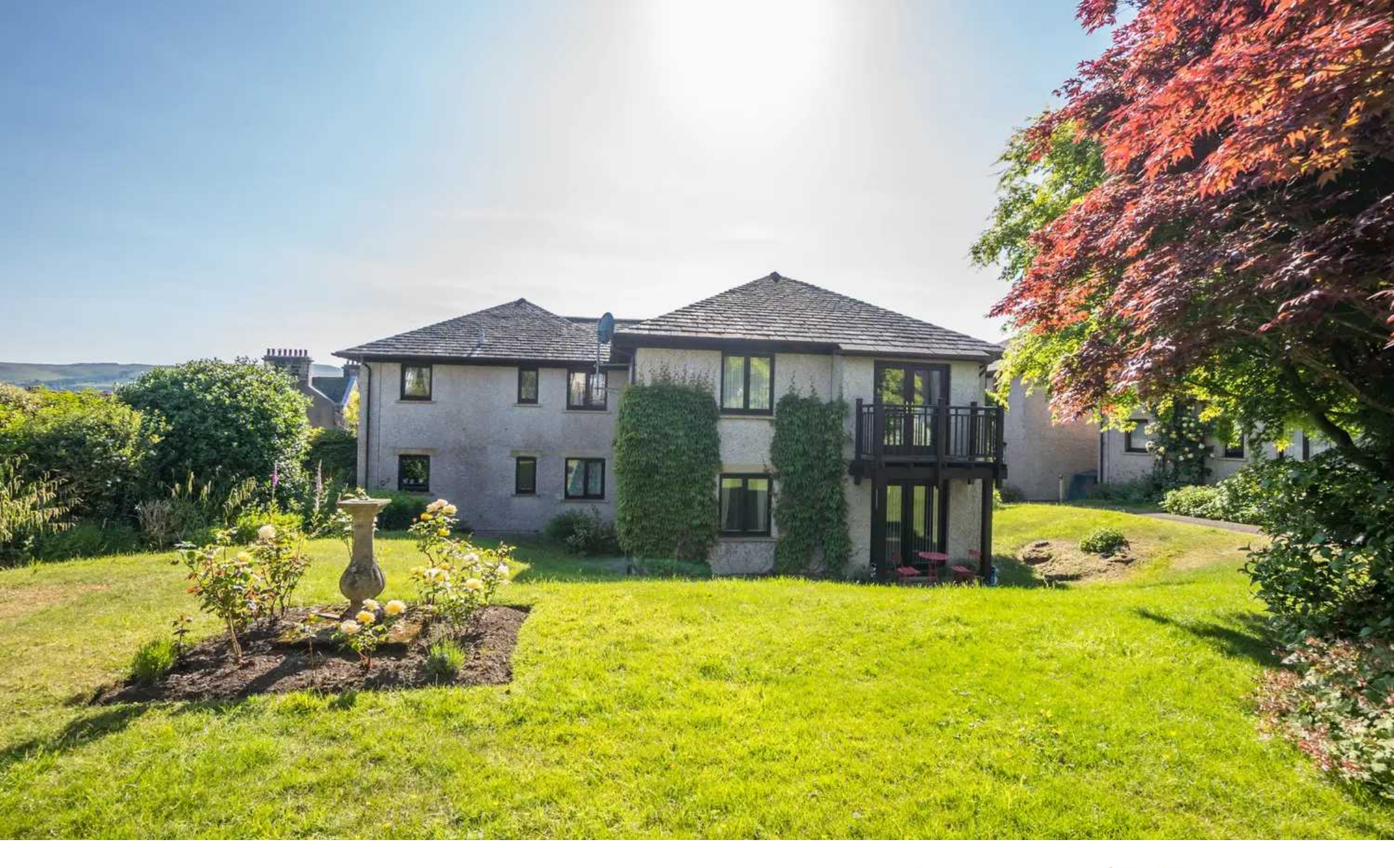
Flat 12, Eaveslea New Road, Kirkby Lonsdale £179,000 Leasehold