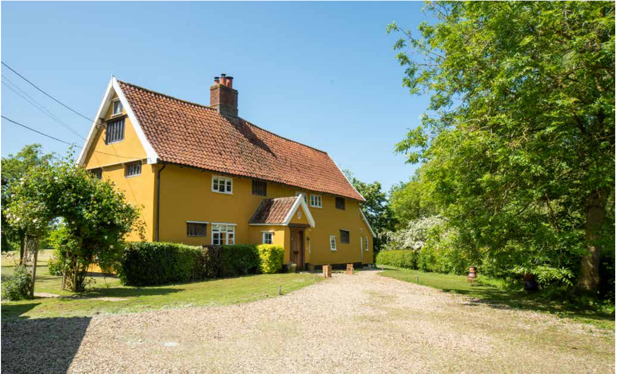
'Captivating Period Home' Stradbroke, Suffolk | IP21 5NJ