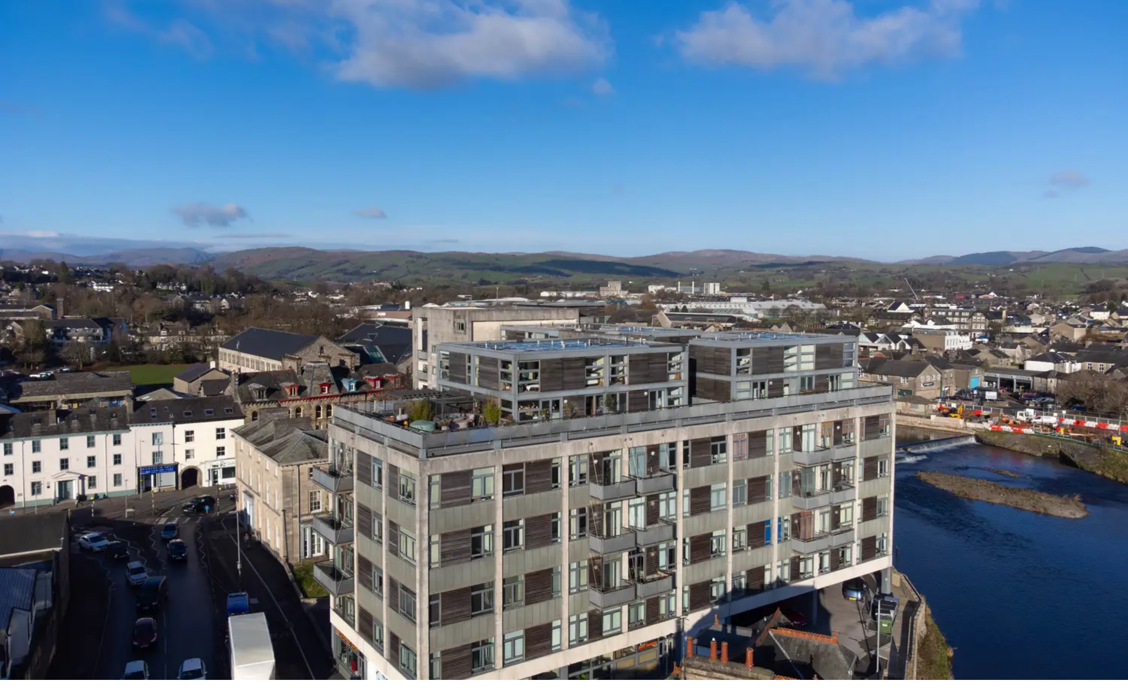
515 Sand Aire House Stramongate, Kendal £210,000