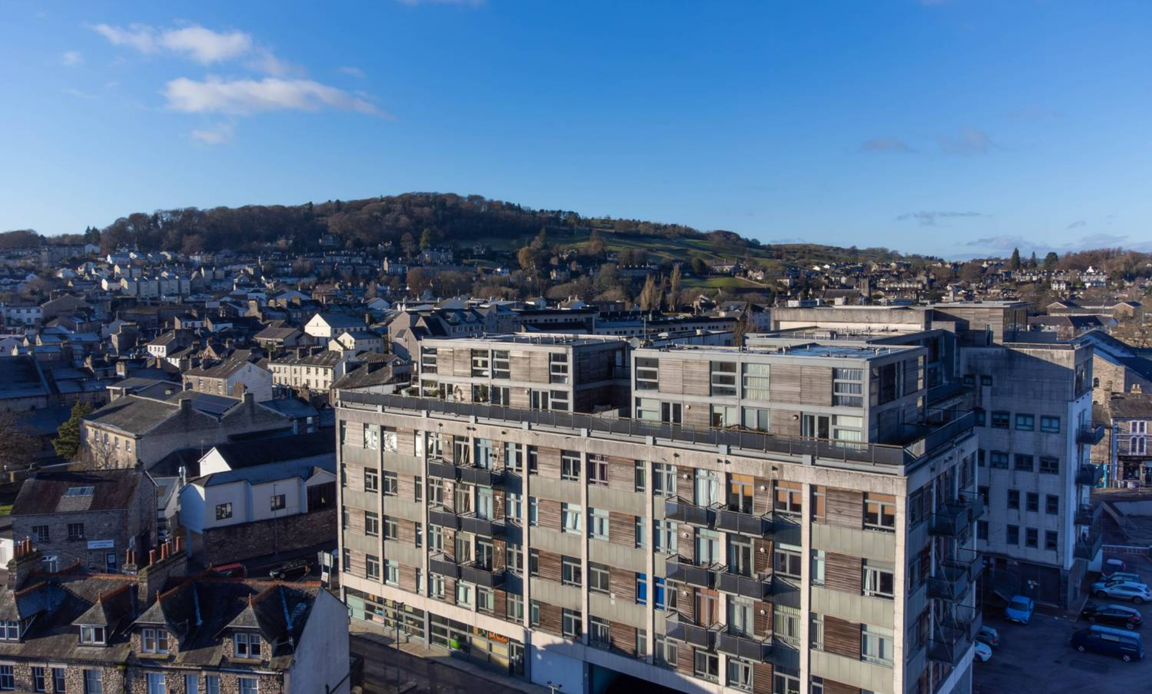
515 Sand Aire House Stramongate, Kendal £170,000