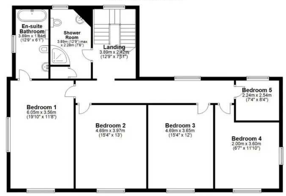
Total area: approx. 296.3 sq. metres (3189.0 sq. feet) THIS FLOOR PLAN IS FOR ILLUSTRATION ONLY AND IS NOT A SCALE DRAWING Plan produced using Planup.