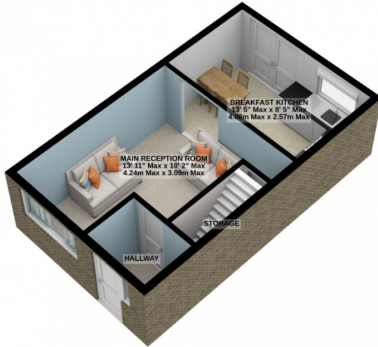
GROUND FLOOR 307 sq.ft. (28.5 sq.m.) approx.