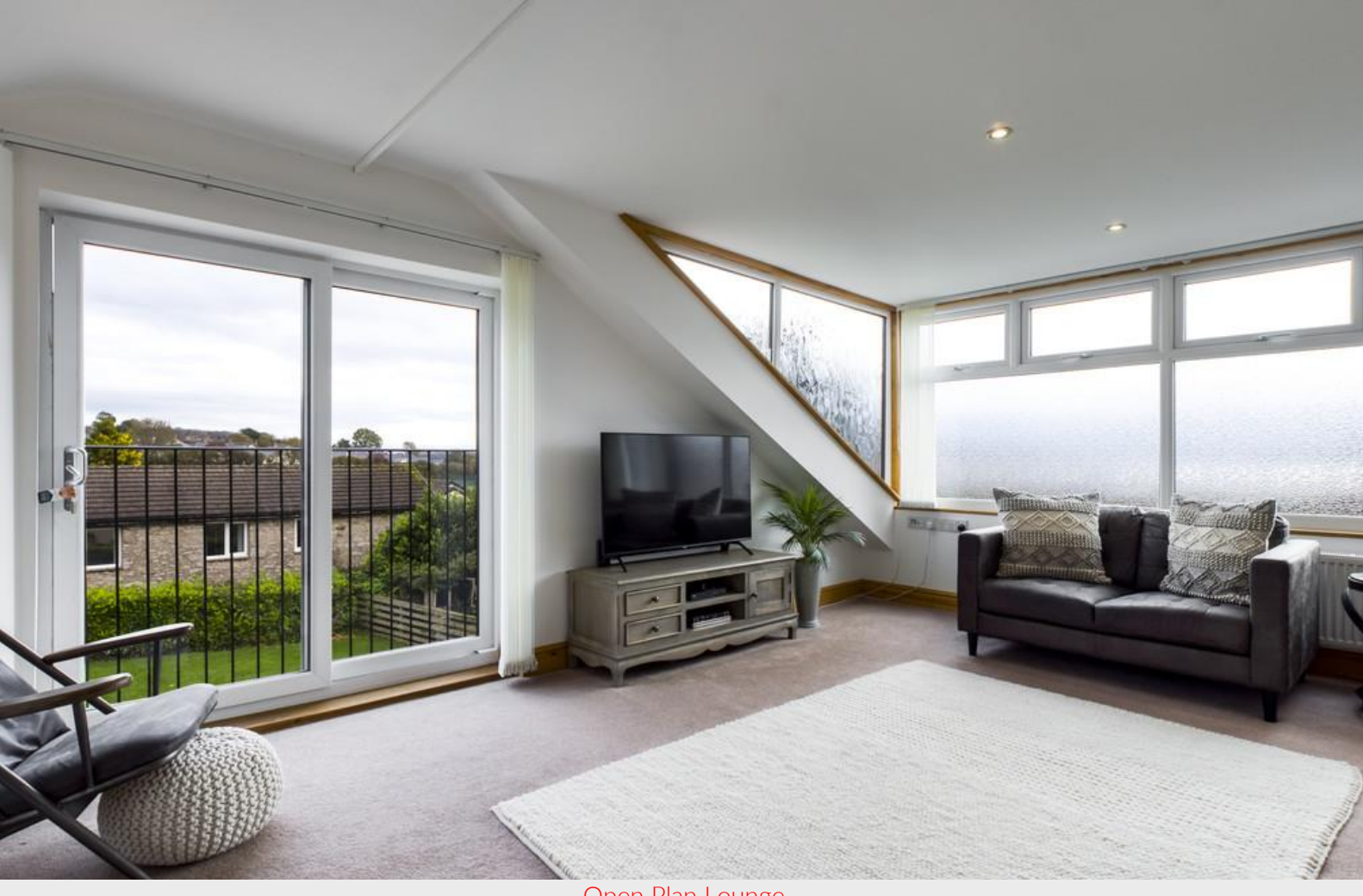
Open Plan Lounge

Location: Situated approximately ¾ of a mile from the Town Centre where a wide variety of amenities can be found. To reach the property proceed westwards out of Grange in the direction of Allithwaite along 'The Esplanade' past the Fire Station and take the fourth left into 'Cart Lane'. Go past the turning on the left for 'Yew Tree Road' and turn immediately right onto a shared drive. 'Monton' is at the end of the short drive.