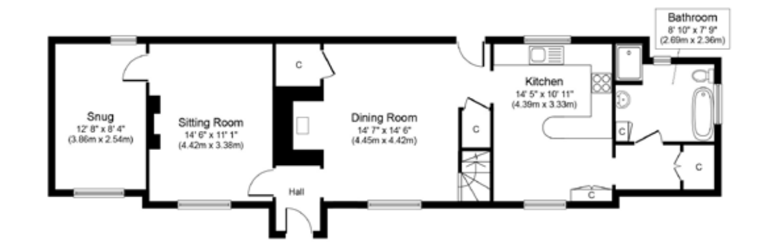
Ground Floor Approximate Floor Area 860 sq. ft. (79.9 sq. m.)

Whilst every attempt has been made to ensure the accuracy of the floor plan contained here, measurements of doors, windows, rooms and any other items are approximate and no responsibility is taken for any error, omission, or mis-statement. This plan is for illustrative purposes only and should be used as such by any prospective purchaser or tenant. The services, systems and appliances shown have not been tested and no guarantee as to their operability or efficiency can be given.