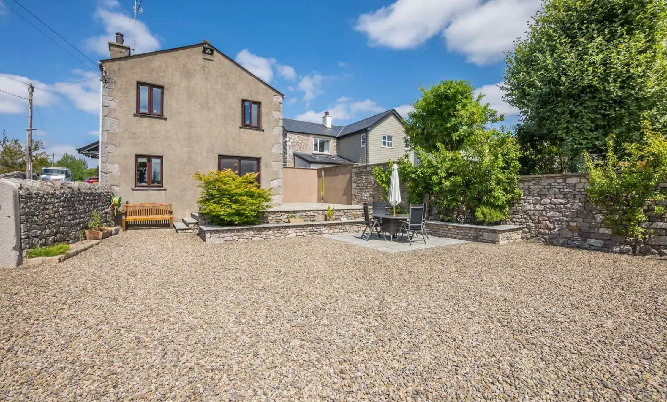
Rose Cottage Carr Bank Road, Carr Bank £500,000 Freehold