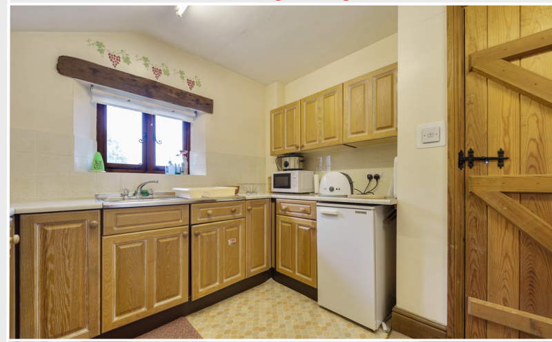
Garden Cottage Breakfast Kitchen