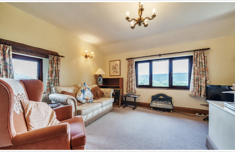
Garden Cottage Sitting Room