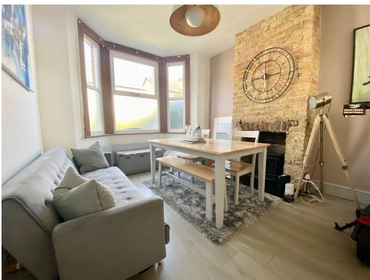
26 Richmond Road, Beddington, Surrey, CR0 4SE | £390,000 Freehold

Paul Graham are delighted to offer this pretty period terrace house which is located within a short distance of Beddington Park. Local shops and supermarkets can be found close by along with reputable schools including Beddington Infants and Beddington Primary schools. The property which boasts a good size rear garden has two reception rooms, a modern kitchen and potential for a Wc/shower on the ground floor. Upstairs there are two double bedrooms and a large bathroom on the first floor. Local transport via bus, rail and tram offer links into London. No chain.