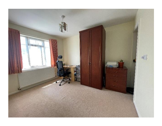
Bedroom 3 3.06m (10'0") x 1.82m (5'11") Double glazed window to rear, radiator, coved ceiling, laminate flooring:

Double glazed window to front, radiator, storage alcove: