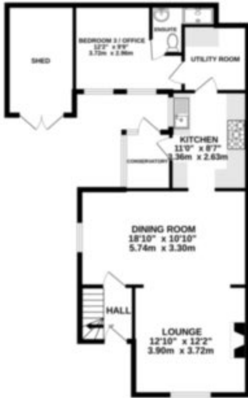
GROUND FLOOR 702 sq. ft. (65.2 sq. m.) approx.