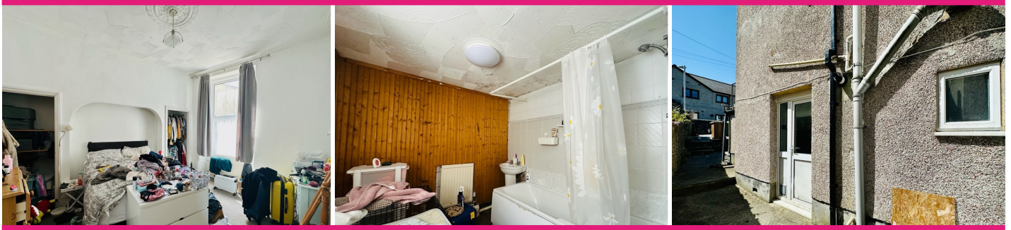
GROUND FLOOR 788 sq.ft. (73.2 sq.m.) approx.