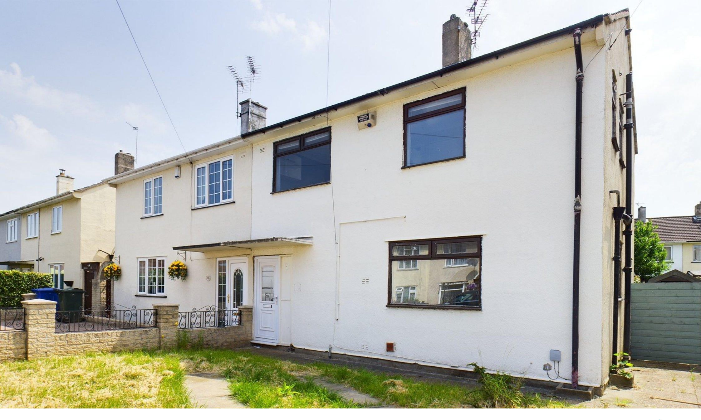
42 Chatsworth Crescent , Doncaster , DN5 9JU £100,000 Freehold