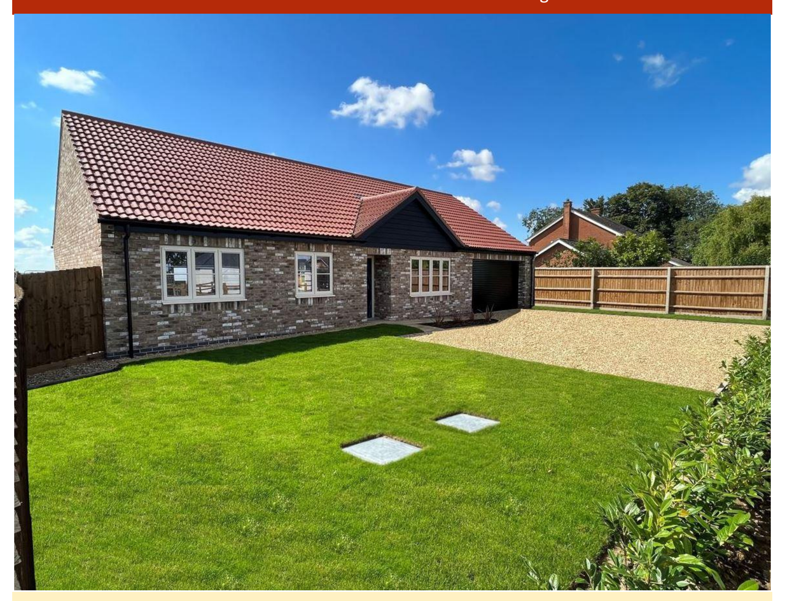
'The Hazel', 23 Jekils Bank, Holbeach St Johns, Spalding PE12 8RF NEW PRICE - £399,950 Freehold

SPALDING RESIDENTIAL: 01775 766766 www.longstaff.com