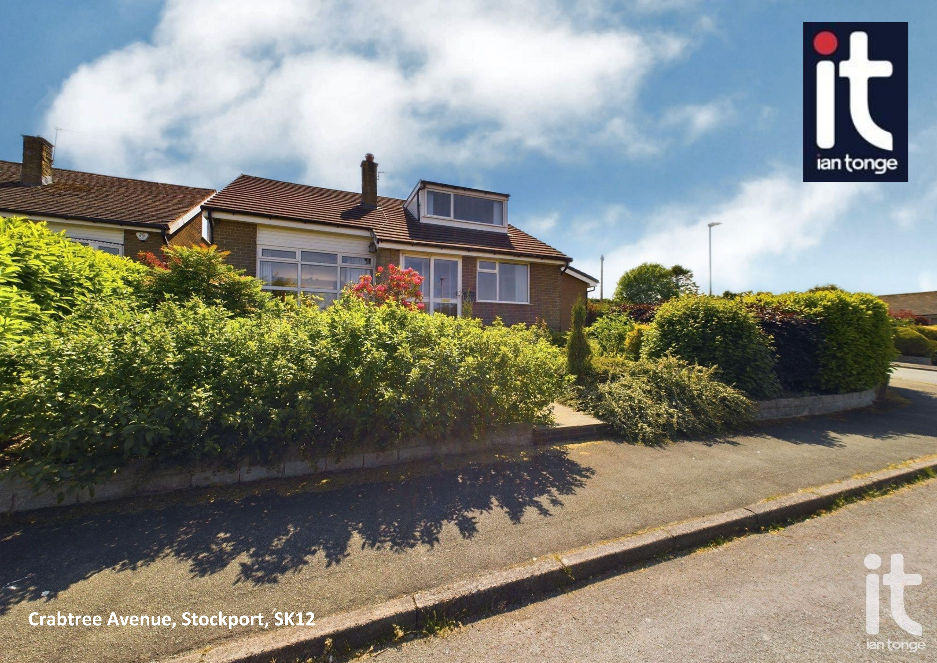
Crabtree Avenue, Stockport, SK12