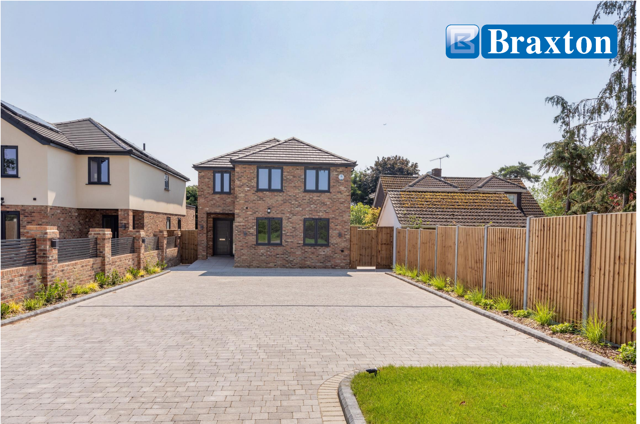
Field House, Waltham Road, White Waltham, Berkshire SL6 3JD