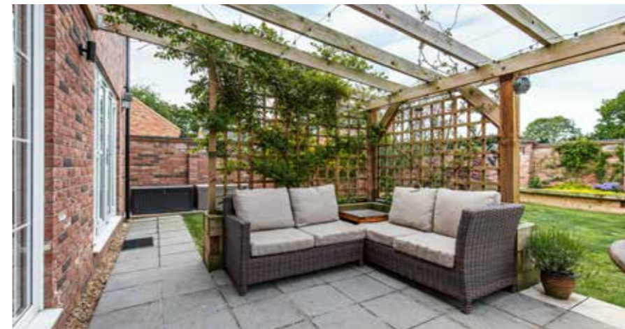
The garden at 6 Fieldings Drive.

“It’s a private location within a quiet village, and there are lots of lovely walks nearby, especially for dog walking.”