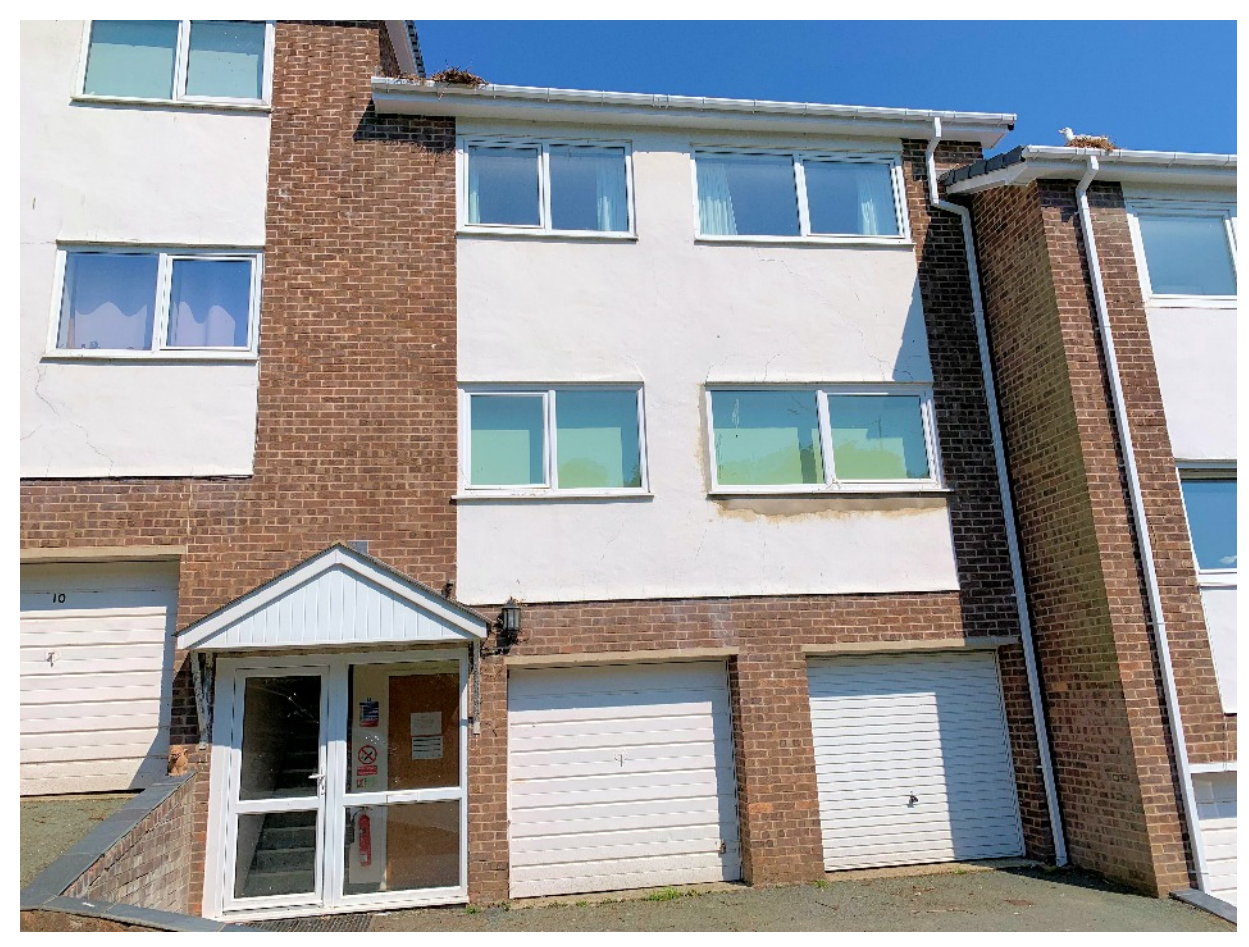
Two bedroom 2<sup>nd</sup> floor apartment with partial sea views from the lounge and kitchen, gas central heating, parking and 36° garage.