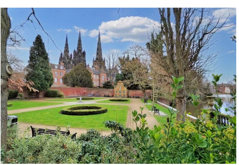
Nearby memorial gardens