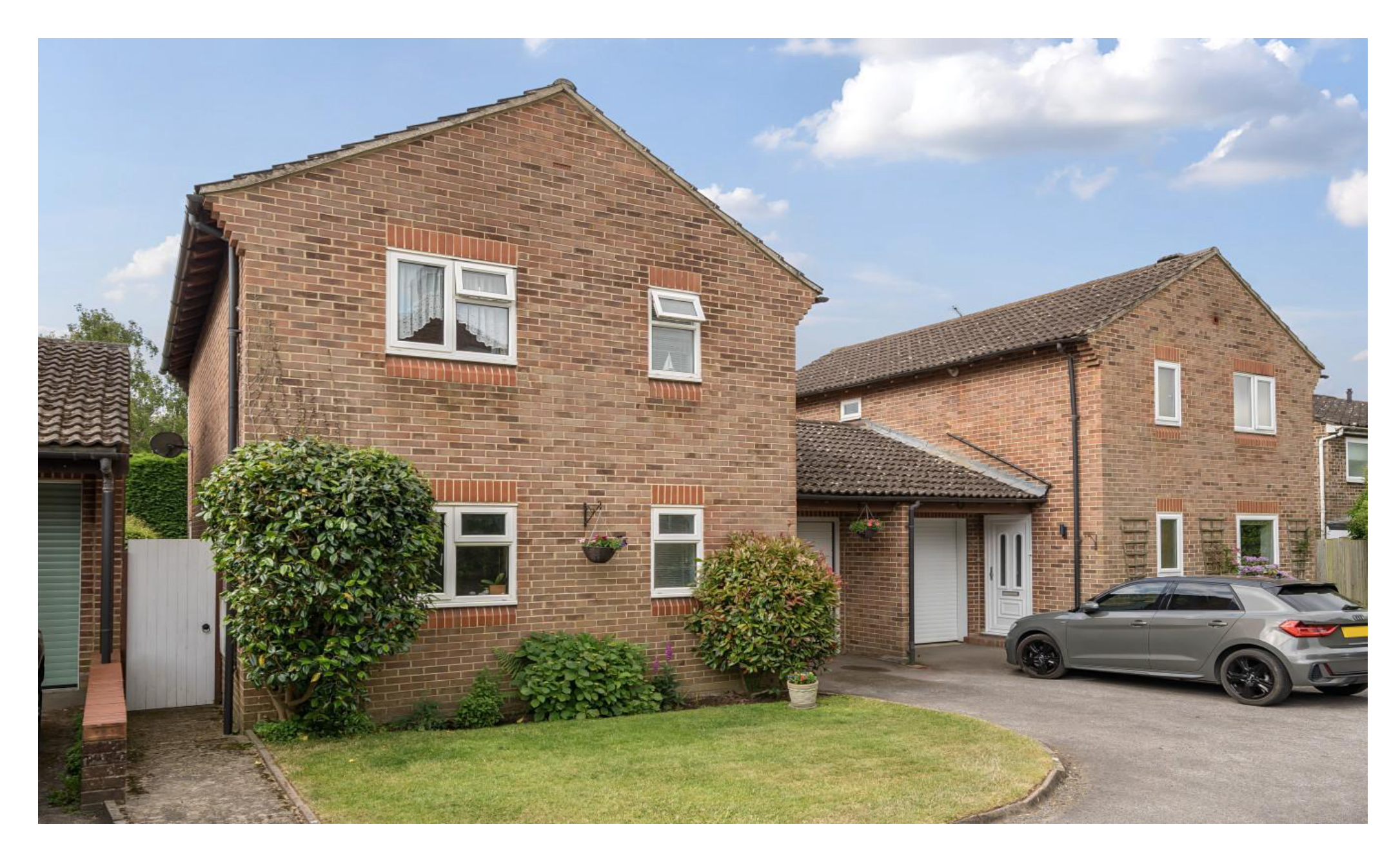
£399,950 Orchard Way, Pulborough, West Sussex