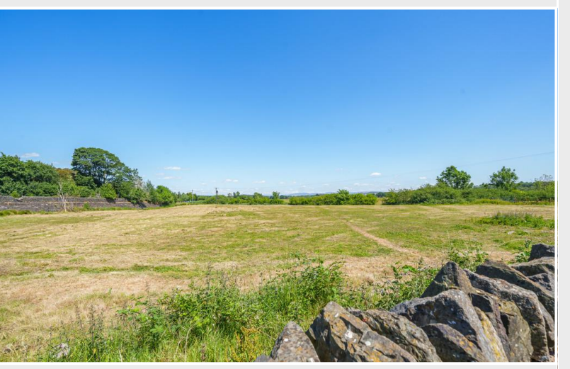
View from Rear