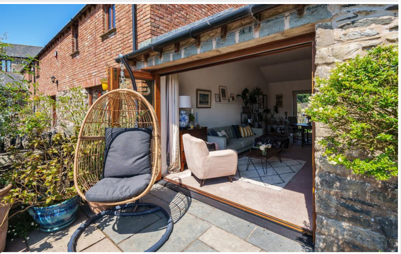
Bi-folding doors to Patio