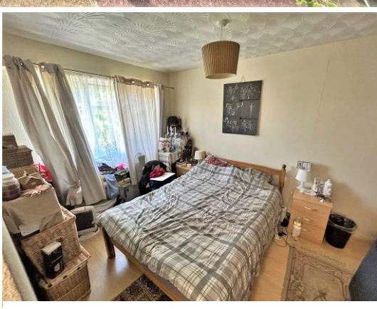
GRAVESHAM BOROUGH COUNCIL COUNCIL TAX BAND C

All measurements are approximate and are taken at the widest points. They should not be used for the purchase of furnishings. These particulars are issued on the express understanding that all negotiations are conducted through 2-Move Property Services Limited. They do not form part of a contract and are for general guidance only. We would strongly recommend that the information which we provide about the property is verified by yourselves on inspection and also by your solicitor before legal commitment to the purchase. Photos subject to copyright law.