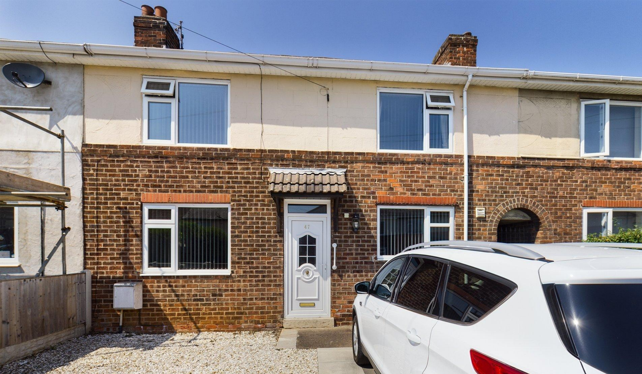
47 Elm Road, Doncaster, DN6 8PQ £130,000 Freehold