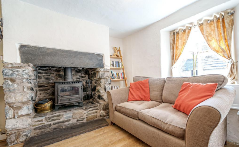
Sitting Room Area