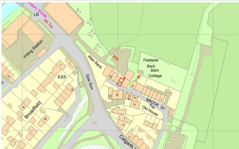
Ordnance Survey Ref: 01109053