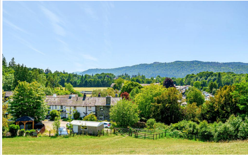
View looking down to the property