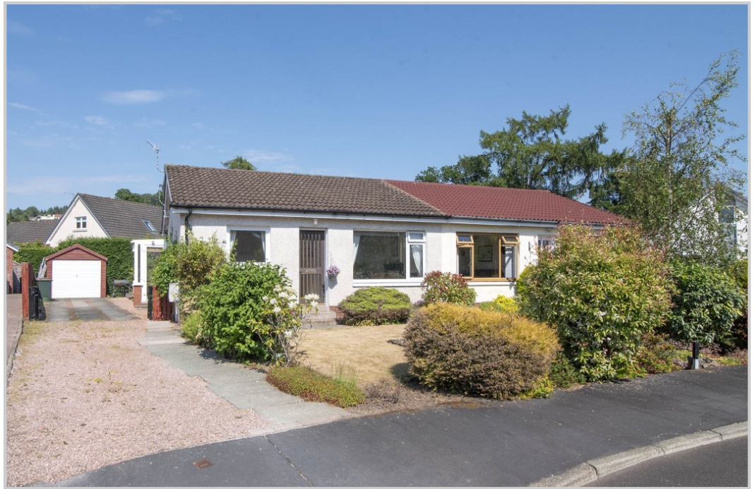
These particulars are believed to be correct, but their accuracy is not guaranteed and they do not form part of any contract. All measurements are approximate only.