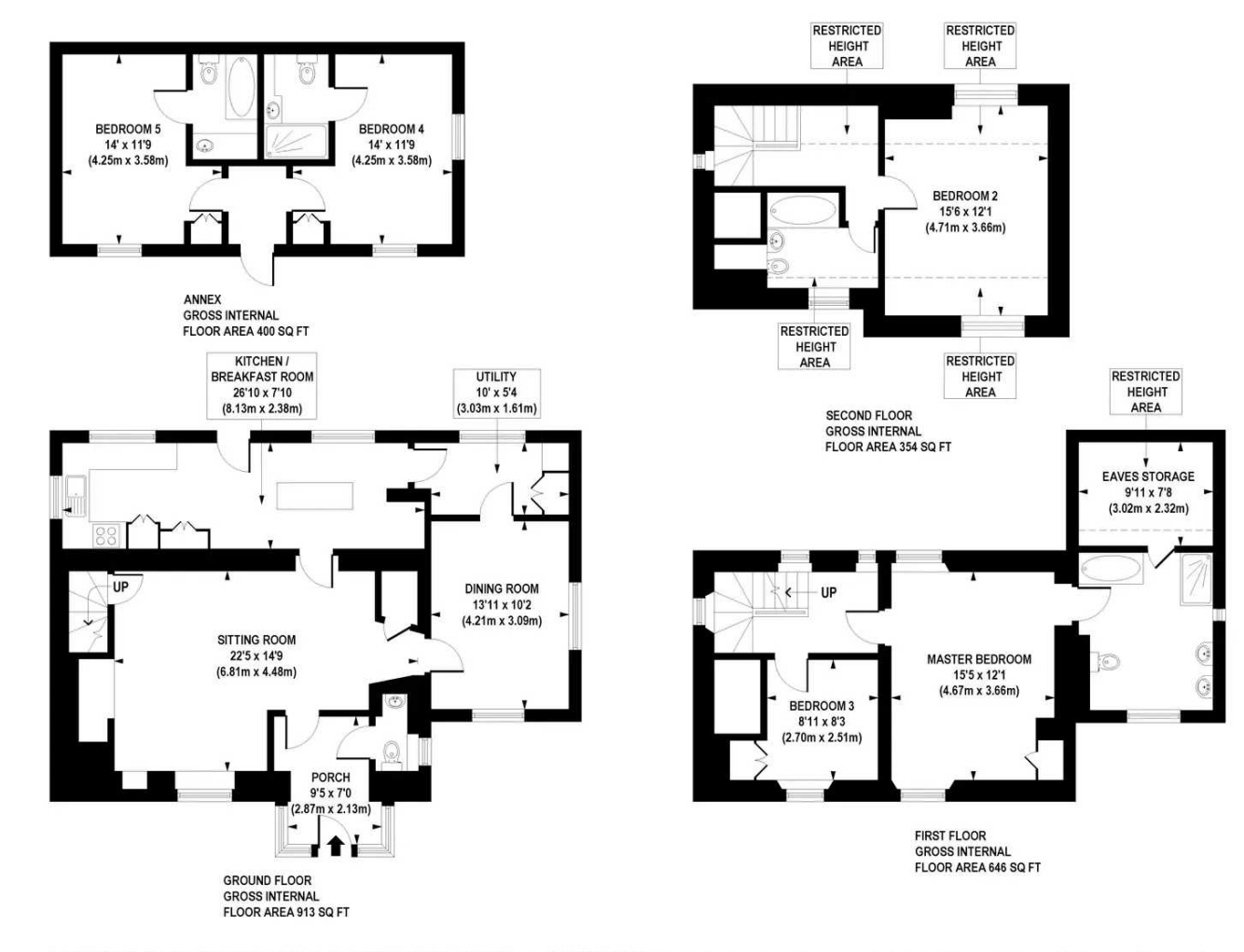
APPROX. GROSS INTERNAL FLOOR AREA 2313 sq. ft / 214.90 sq. m (Including Annex, Restricted Height Area & Eaves Storage) Annex = 400 sq.ft / 37.18 sq.m Restricted Height Area and Eaves Storage = 166 sq.ft / 15.42 sq.m