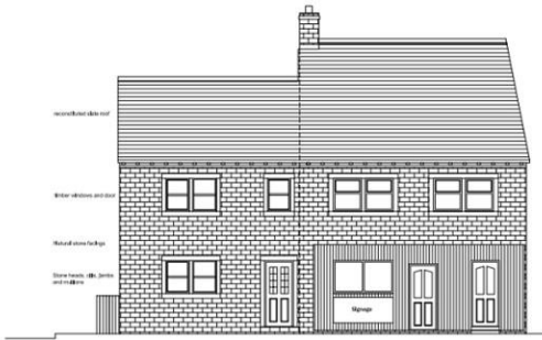
Proposed Front Elevation (Market Street) 1:50 @ A1