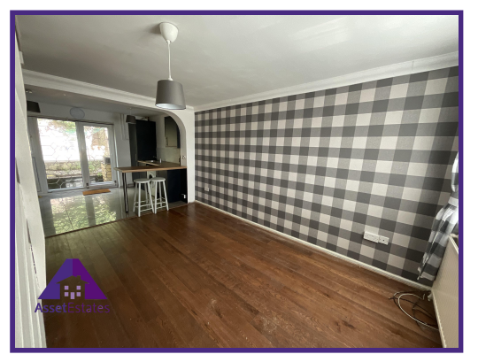
Briar Close, Rassau, Ebbw Vale