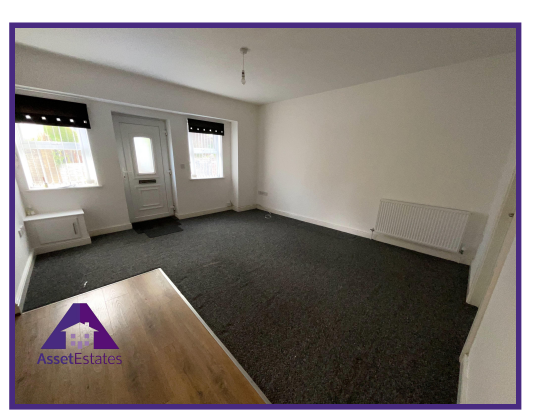
Evelina House, Queen Street, Nantyglo