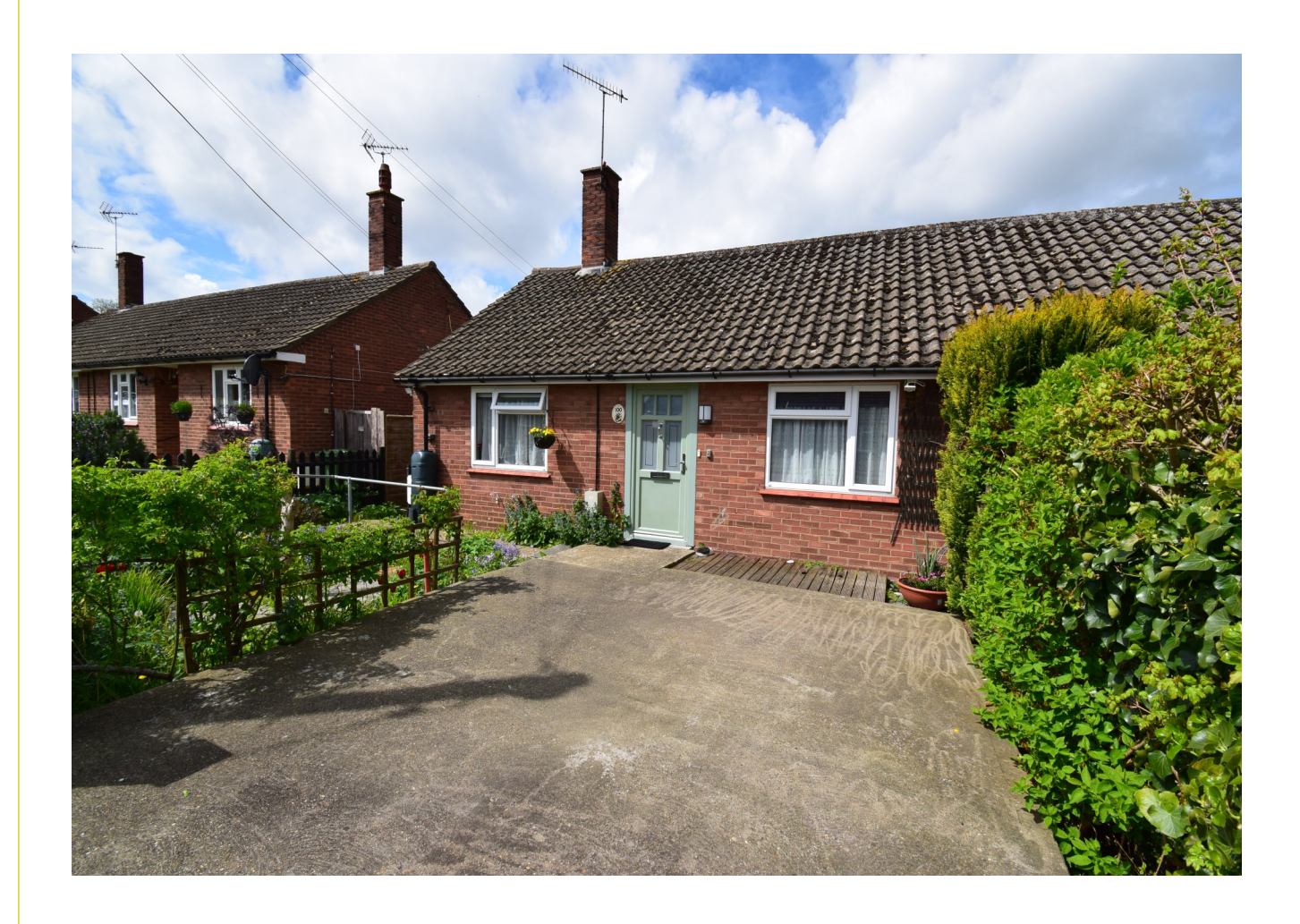
SAXON ROAD, SAXMUNDHAM, SUFFOLK IP17 1EF GUIDE PRICE: £225,500 FREEHOLD

An extended semi detached bungalow with a good sized back garden in a popular residential area in the market town of Saxmundham .