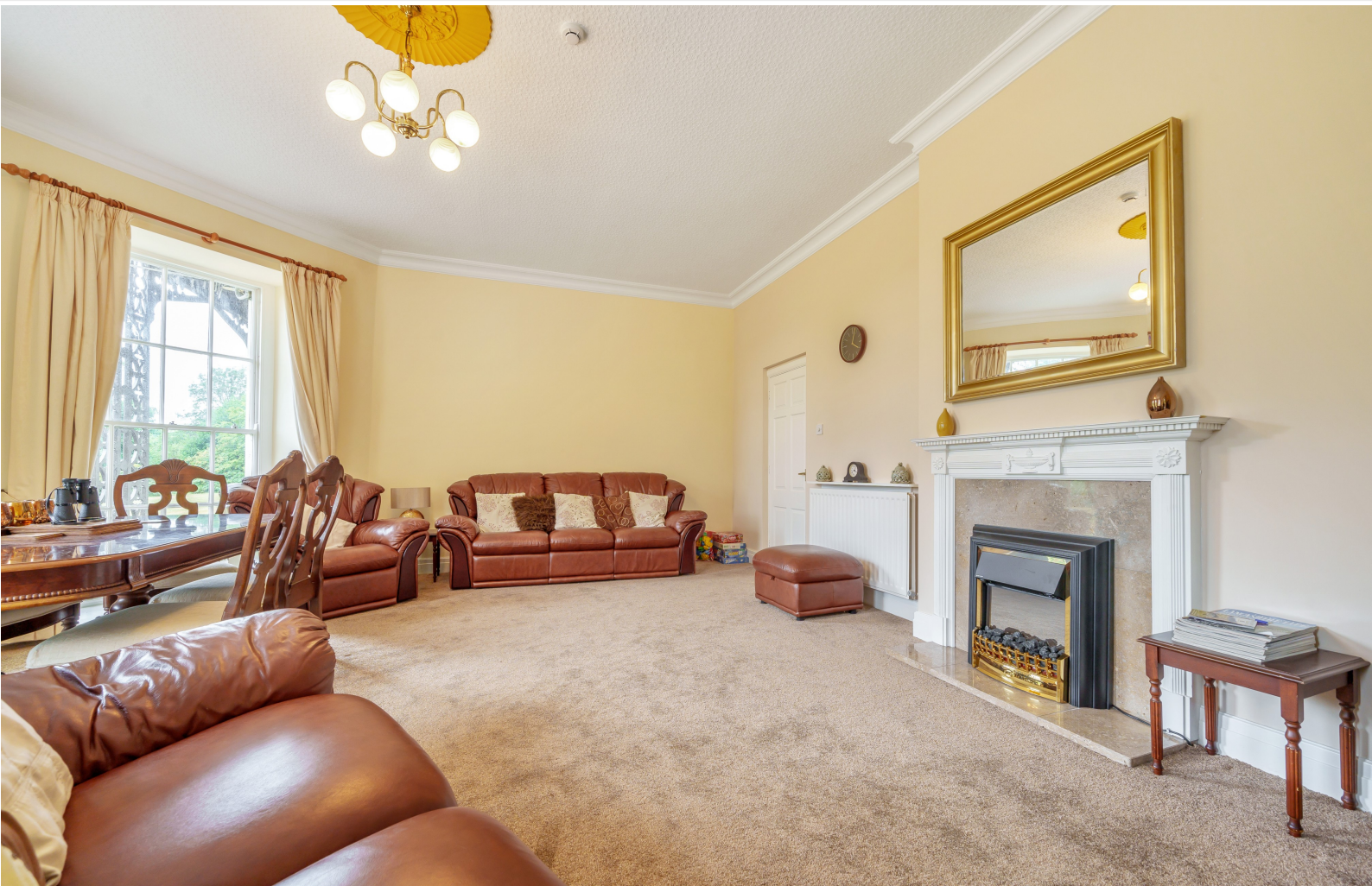
Lounge/ Dining Room

Request a Viewing Online or Call 015394 32800