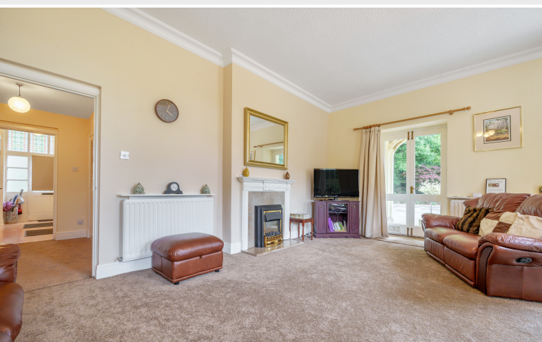
Lounge/ Dining Room