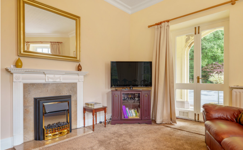
Lounge/ Dining Room