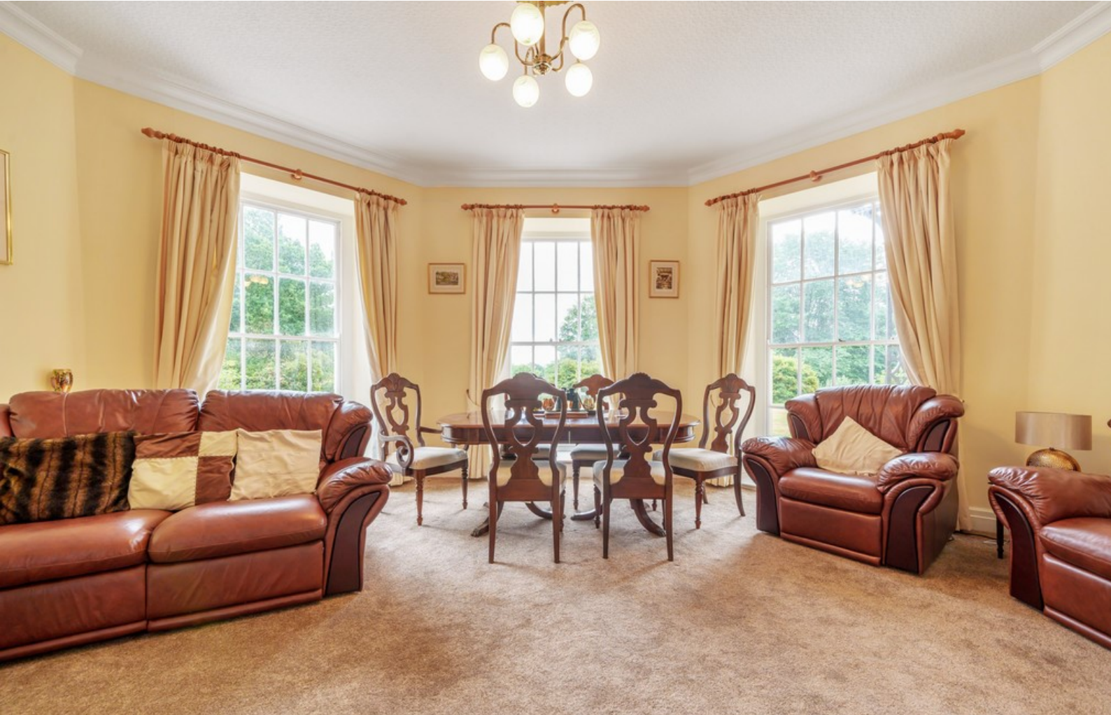
Lounge/ Dining Room