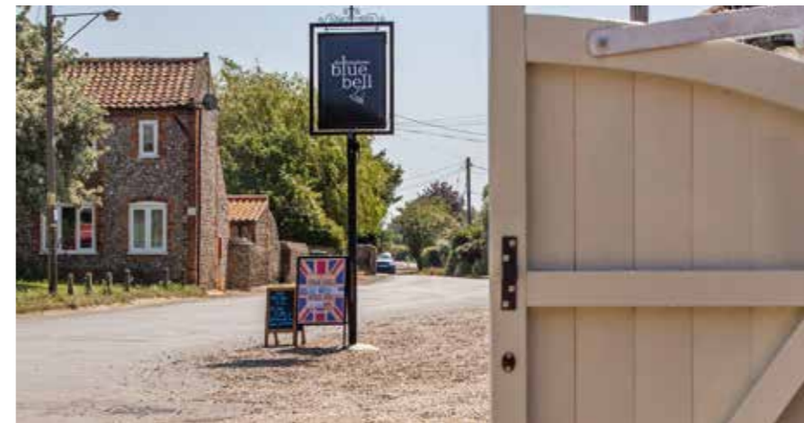
The Langham Blue Bell

“The popular village pub is just a stone’s throw away.”