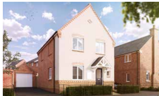
The Dove 3-bedroom home