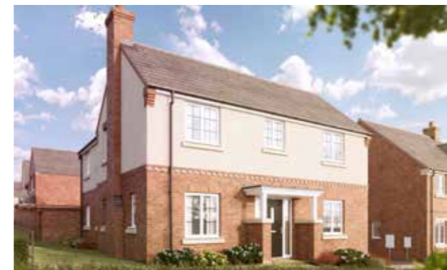
The Beamish 4-bedroom detached home