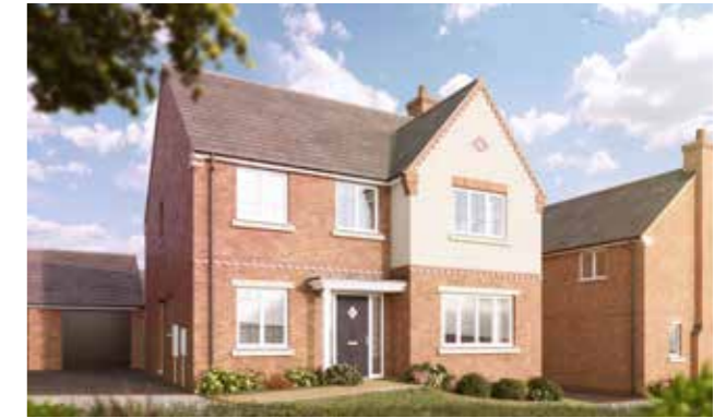
The Severn 4-bedroom detached home