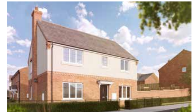
The Blyth 4-bedroom detached home