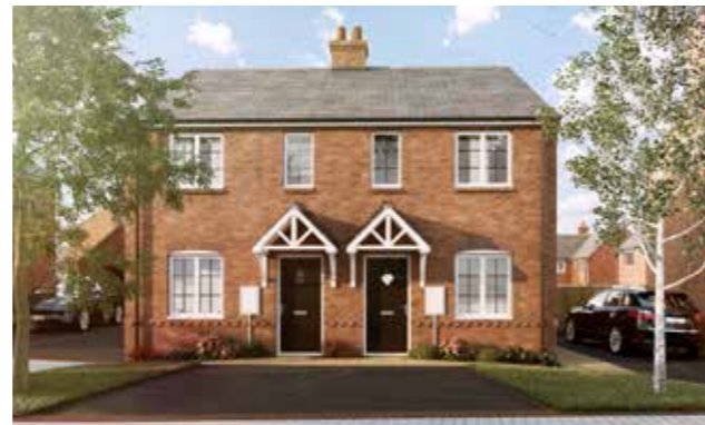
The Rother 2-bedroom home