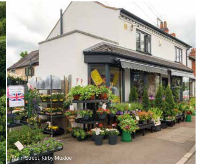
Main Street, Kirby Muxloe