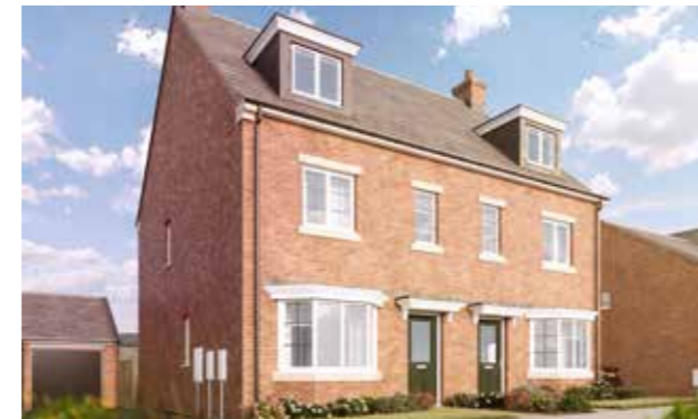
The Solway 3-bedroom home