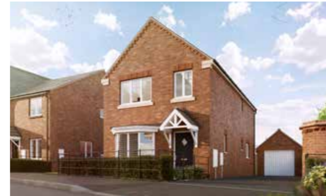
The Lea 3-bedroom home