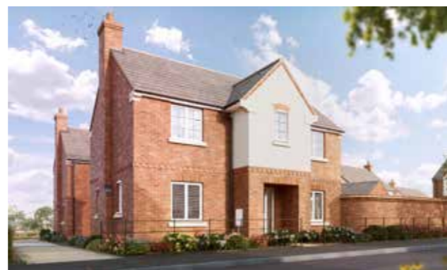
The Dee 3-bedroom home