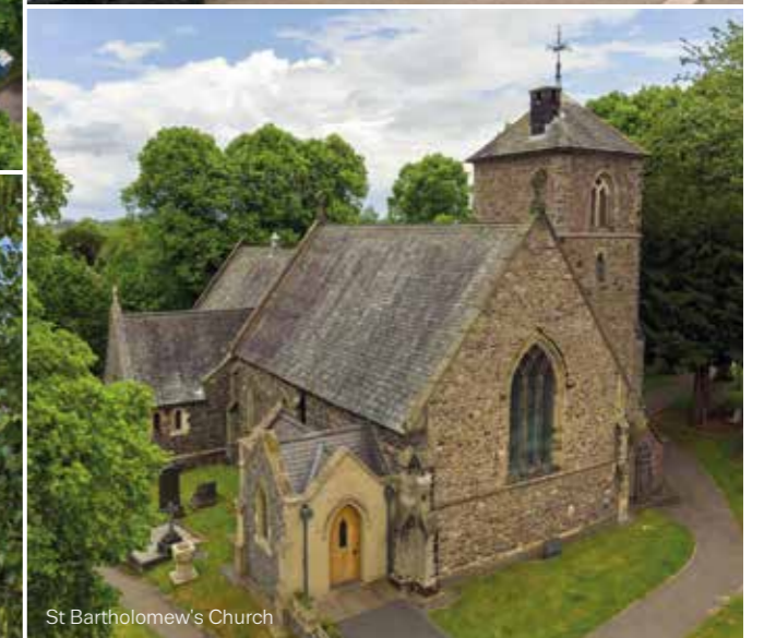
St Bartholomew's Church