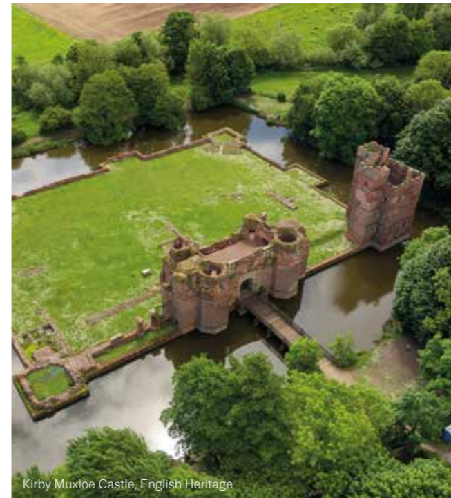
Kirby Muxloe Castle, English Heritage

With all the amenities right on your doorstep— from independent shops, salons and pubs to a library, post office, golf club and a village hall – Kirby Muxloe has everything your family could ever need. Whether you're a couple, growing family or looking to downsize to a more peaceful location, there is something for everyone at Hastings Green.