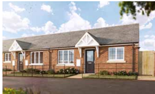
The Glaven 2-bedroom home

Our incredible expertise, craftsmanship and attention to detail is what makes the William Davis difference. Symphony fitted kitchens, Smeg appliances and Roca ceramics ensure every home is built with quality in mind.