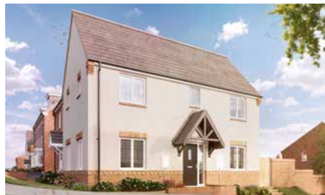
The Teme 3-bedroom home