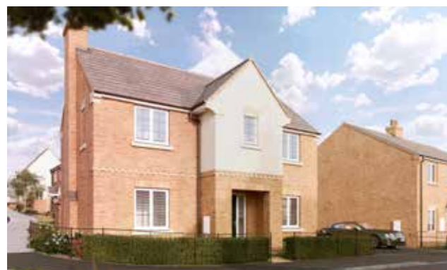
The Nene 3-bedroom home