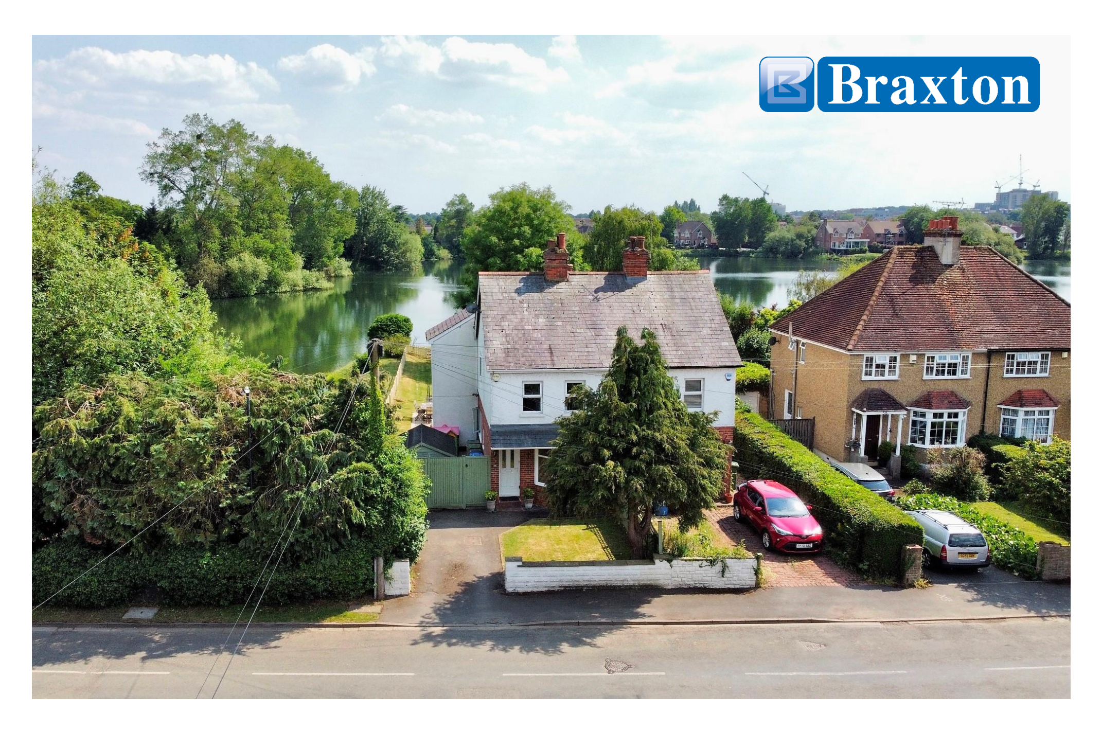
62 Summerleaze Road, Maidenhead, Berkshire SL6 8EP